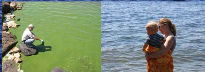
Algae blooms or clear water? Your choices can make a difference!

Switch to “P-free” fertilizers and pick up a “Healthy Lawn Tips” brochure here.